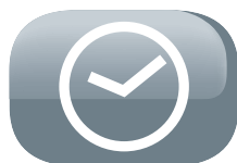
Timer (8 hour)