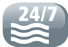
Permanent water drainage tube